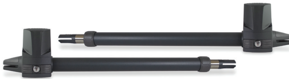
LEADER TI Pair of swing motors and fittings